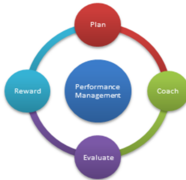
Figure 1 Flowchart of General Performance Assessment as Key Indicators

In general, performance management is a communication effort that is carried out on an ongoing basis between employees and their superiors with the aim of achieving the main goals of a company (Helmold, M., & Samara, W., 2019; Aguinis, H., 2019). The presence of this management is really needed in a company because it can help align employees with other resources so that the company's goals are achieved optimally.